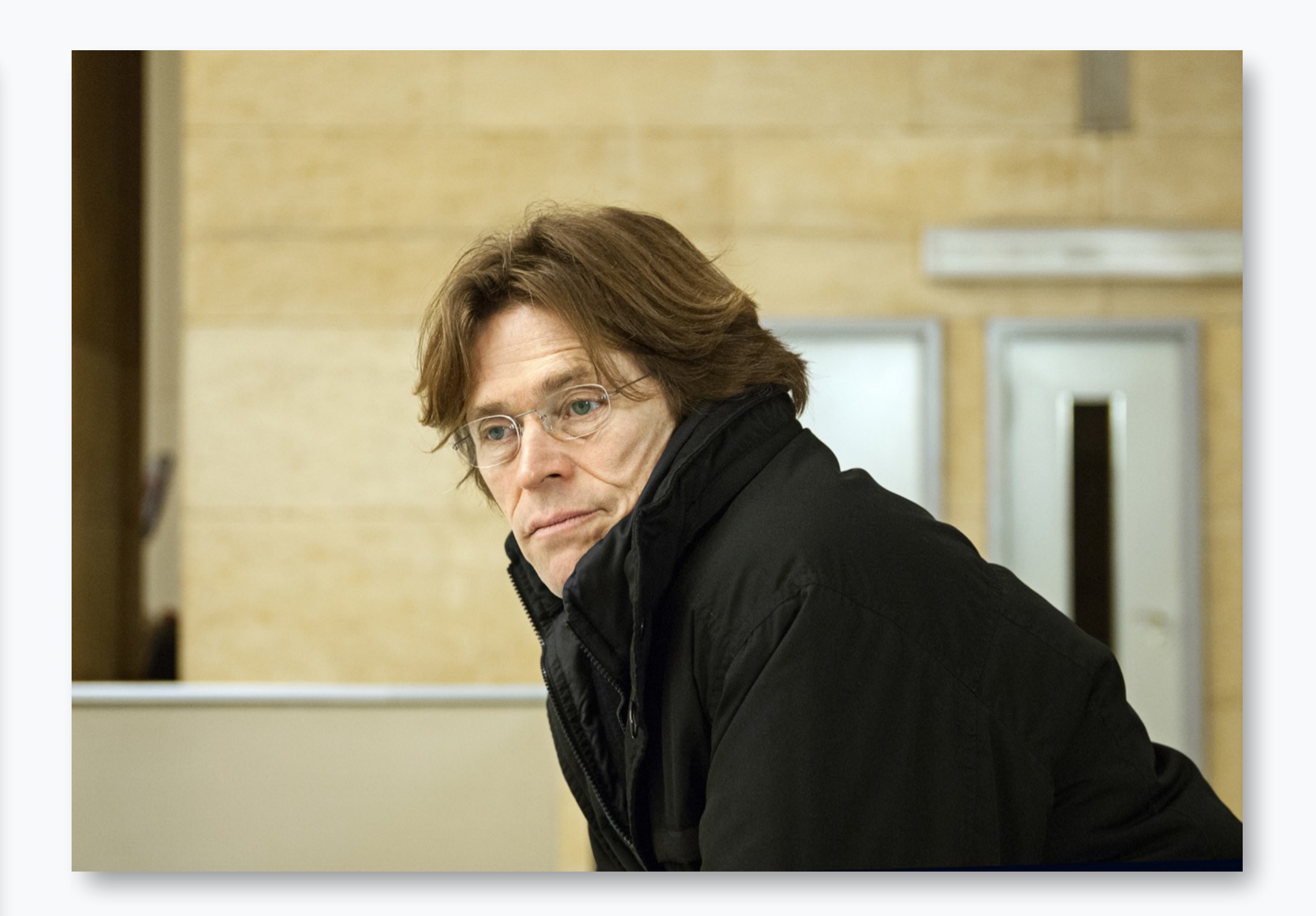
Kanella Tragousti Willem Dafoe 70 x 100 cm.